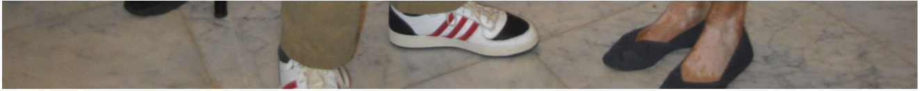
Malachi McCants and Casey Payton

Event sponsors included BoltNagi PC, deSIGNS, The Cattie Law Firm PC, and 81C.